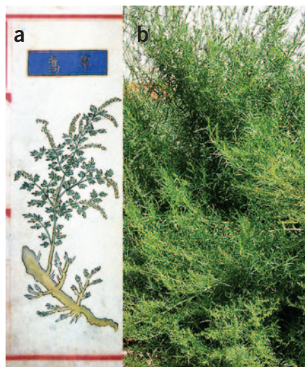
Figure 2 Artemisia annua L. (a) A hand-colored drawing of qinghao in Bu Yi Lei Gong Pao Zhi Bian Lan (Ming Dynasty, 1591 CE). (b) Artemisia annua L. in the field.

We subsequently separated the extract into its acidic and neutral portions and, at long last, on 4 October 1971, we obtained a non-toxic, neutral extract that was 100% effective against parasitemia in mice infected with Plasmodium berghei and in monkeys infected with Plasmodium cynomolgi . This finding represented the breakthrough in the discovery of artemisinin.