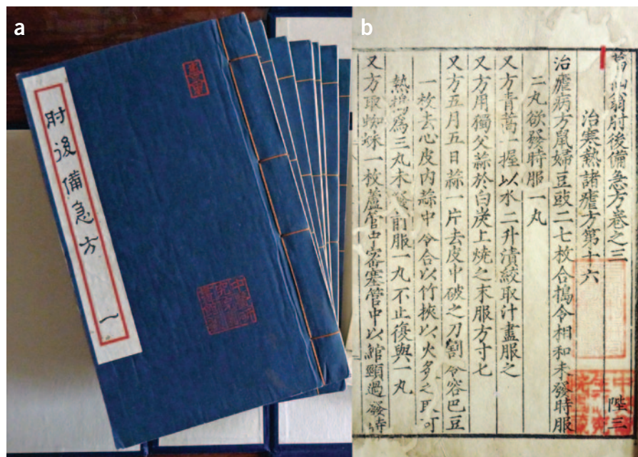
Figure 1 A Handbook of Prescriptions for Emergencies by Ge Hong (284–346 CE). (a) Ming dynasty version (1574 CE) of the handbook. (b) “A handful of qinghao immersed with 2 liters of water, wring out the juice and drink it all” is printed in the fifth line from the right. (From volume 3.)

Youyou Tu is at the Qinghaosu Research Center, Institute of Chinese Materia Medica, China Academy of Chinese Medical Sciences, Beijing, China. e-mail: youyoutu1930cn@yahoo.com.cn